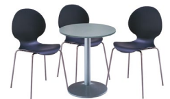
3 chairs 1 table