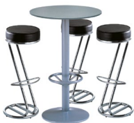
1 high top table 3 bar stools