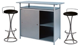
1 closed counter 2 bar stools