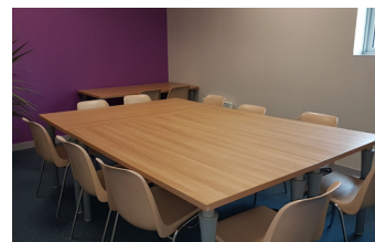
Maine Room 1-2